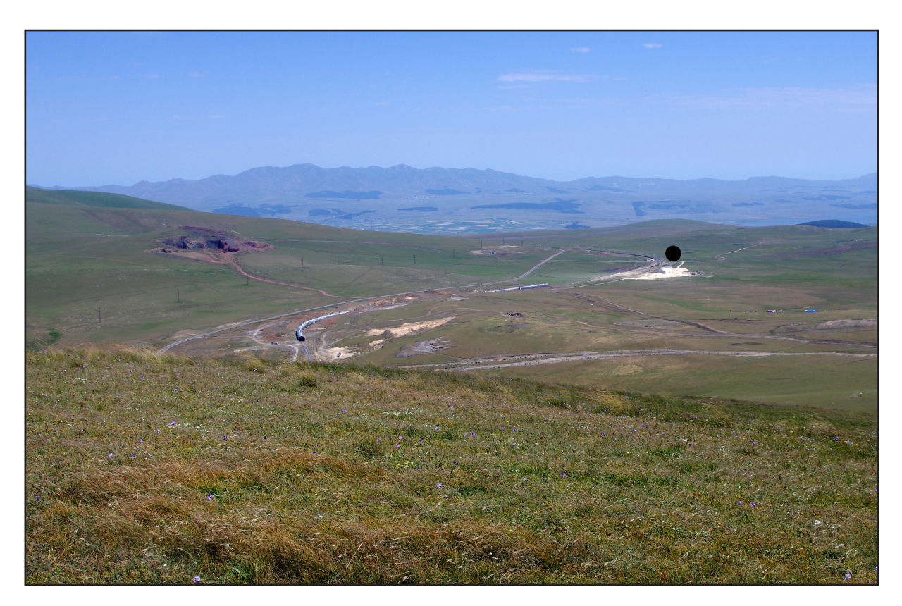
Figure 2: The Javakheti Highland photographed from Mt. Chikiani and the location of the place from which the andesite Levallois point was collected (black dot).