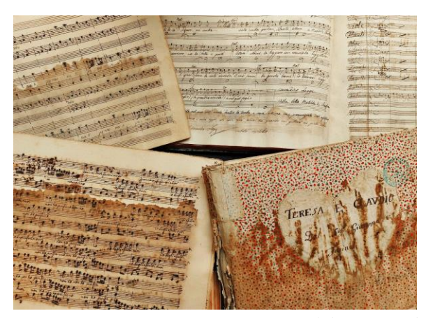
Some of Benedetto Marcello Conservatory of Venice's ancient musical documents damaged by the Acqua Granda phenomenon

The ARMID@Venezia (ARchivio Musicale e Iconografico Digitale A Venezia) project aims to safeguard the extraordinary document collections preserved in the library of the Benedetto Marcello Conservatory of Venice, heavily damaged by the exceptionally high tide of November 2019 (named "Acqua Granda"). The project provides to digitalize, through high photographic reproduction, virtually restore and investigate in detail the materials (supports, inks, pigments and dyes, etc.) with a view to their future physical restoration. Only non-invasive and non-destructive techniques are being employed, such as Imaging Analysis in the Visible (including macro- and micro-photographic examination), near-infrared (NIR) and near-ultraviolet (UV-Induced Fluorescence, Reflected UV) range, on representative artefacts. Non-invasive spectroscopic techniques, such as Fiber Optic Reflectance Spectroscopy (FORS), Infrared Spectroscopy (FTIR, NIR, DRIFT), μ-Raman and X-Ray (XRF) are being applied as well for the chemical characterization of materials. The result of near-infrared, UV-Induced Fluorescence and X-Ray investigation to reveal the damage of brackish water caused by the "Acqua Granda" phenomenon on ancient materials (inks and papers) will be presented.