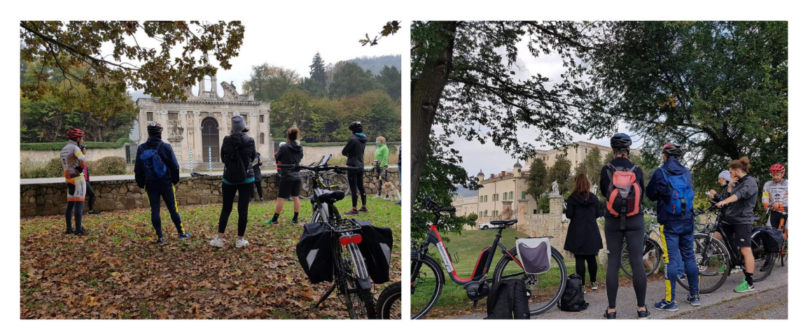
Fig. 4. Giardino Storico di Valsanzibio -PD-. Tours in September 2021. Marco Trevisan; all rights reserved; Fig. 5. Castello del Catajo, Battaglia Terme -PD-. Tours in September 2021. Marco Trevisan; all rights reserved

(Citton 2014) and forms of knowledge. The festival, although providing an alternative service to the usual spaces, is a promoter of an ecological conception of experience, relevant also to social and mental sustainability spheres.