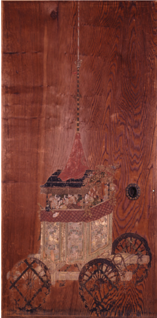
Fig. 5. One of the floats paraded in the Gion festival, Taishi yamaboko. Detail of a door, seventeenth century, colour on wood. Attributed to Kanō Atsunobu.