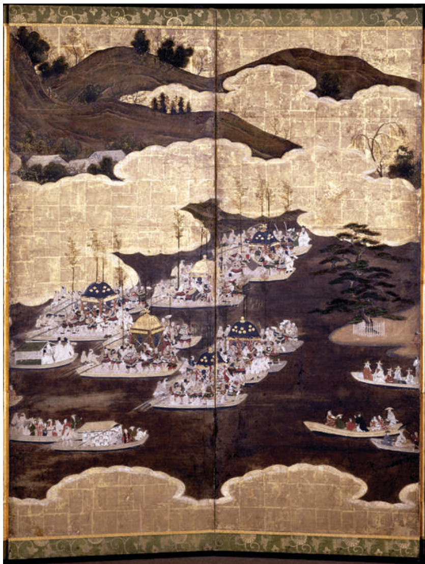
Fig. 4. Portable shrines of the Sannō deities on boats. Details from a pair of six-panel screens illustrating the Hie shrine and its festival. Kanei period (1624–1644). © Trustees of the British Museum, London.