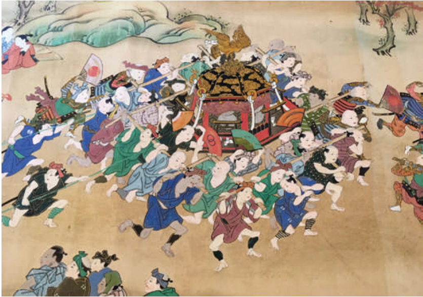
Fig. 3. Sannō kami carried down from the Hie shrine. Details from Hie Sannō sairei emaki , seventeenth century, colour and gold on paper.

In a letter written from the capital on 4 th October 1571, Luís Fróis provided his superior with further details on the Hie deities and again described the popularity and opulence of the shrine complex and the lavish festival staged on land and water, for which no expense appeared to have been spared. Interestingly, Fróis must have seen such magnificence of places and performances collapse in front of his own eyes, for the letter was written just a few days after Nobunaga had reduced to ashes shrines and non-religious buildings in Sakamoto as well as the temples on Mount Hiei. 114