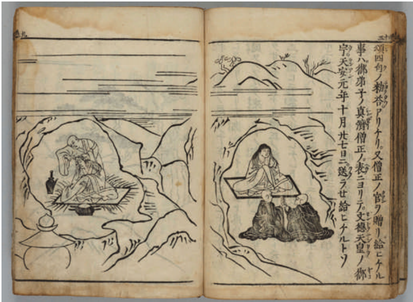
Fig. 1. Kūkai sitting in meditation in the cave where he had been buried. His hair has grown long and one of disciple visiting the cave gives him a haircut. From a Edo period printed version of the Illustrated Deeds of the Great Master of Kōya ( Kōya daishi gyōjō zuga 高野大師行狀圖畫). © Kokubungaku kenkyū shiryōkan, YAヤ4-330-1~2.

throughout the medieval period to promote a devotional cult around Kūkai and attract pilgrims to Mount Kōya. For instance, one of the oldest of these tales, the tenth-century Kongōbuji konryū shugyō engi , recounts that “[Kūkai]’s entry in meditation simply meant that he had closed his eyes and did not speak... Since he was still living like an ordinary person, no funeral was performed... His disciples closed the structure and people had to get permission to enter it.” 102 The mysterious afterlife of Kūkai was also depicted in handscrolls, such as the fourteenth-century Illustrated Deeds of the Great Master of Kōya , widely circulated and later printed 103 (Fig. 1).