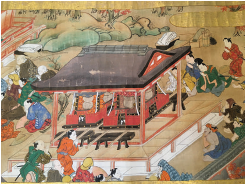
Fig. 2. Venerating Sannō: the portable shrines of the main Sannō deities. Details from Hie Sannō sairei emaki , seventeenth century, colour and gold on paper.

Sannō (lit. 'King of the mountain') is a collective term for the deities protectors of the Tendai school –combinatory entities that were at the same time kami and hotoke . There were twenty-one of them, with seven being considered the central deities. 113 The seven objects Fróis describes are their temporary abodes ( mikoshi ), carried down during the festival in a procession which, today as when the Jesuits observed it, departs from the shrine complex and reaches the banks of Lake Biwa after crossing the town of Sakamoto (Figs. 2 and 3)