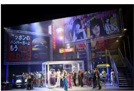
FIGURE 3 Robust versus traditional interpretations: Madama Butterfly by Giacomo Puccini

(a) Traditional interpretation Stage director: Eike Gramss