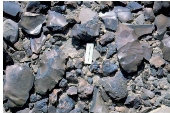
Quarries in Harappa. Fig. 10