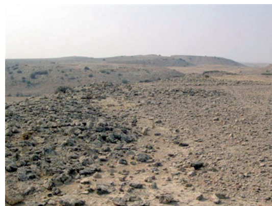
Quarries in Harappa. Fig. 28

The surveys carried out on the Daphro Hills, south of Hyderabad, in Lower Sindh, led to the discovery of other flint extractive quarries also in this region (Biagi 2006). At least three different points of this hill revealed the presence of flint extractive systems similar to those observed along the western mesas of the Rohri Hills in Upper Sindh (Figs. 26 and 27). Apart from ditches excavated along the edges of these limestone mesas, the surveys revealed the presence of flint workshops (Fig. 28), undoubtedly attributable to the Harappan Civilisation, as indicated by the occurrence of characteristic elongate, subconical, flint cores with long blade detachments (Fig. 29). At Daphro, the presence of large-sized pre-cores (Fig. 30), already prepared for being transported, is of major interest. Single pre-core specimens have been found at Mohenjo-daro, the Rohri Hills and Kahiro Bhandari near Badin, close to the Runn of Kutch. This discovery