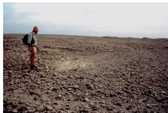
Quarries in Harappa. Fig. 6

the Early Palaeolithic onwards (Biagi and Cremaschi 1988) (Fig. 10). They separate two very different environmental regions, the Indus Valley to the west and the Thar Desert to the east. Their eastern fringes are lapped by the Nara Canal, which flows inside the old bed of the Hakra–Ghaggar River. The hills are limestone mesas (Fig. 11), dissected by erosion and deeply incised by old river courses (Fig. 12).