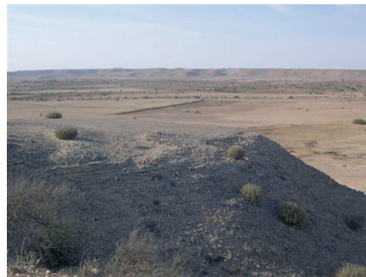
Quarries in Harappa. Fig. 27

its edge, as many decorticating flakes, pre-forms and typical crested blade-like-flakes found inside the ditch fill should indicate” (Starnini and Biagi 2005: 5).