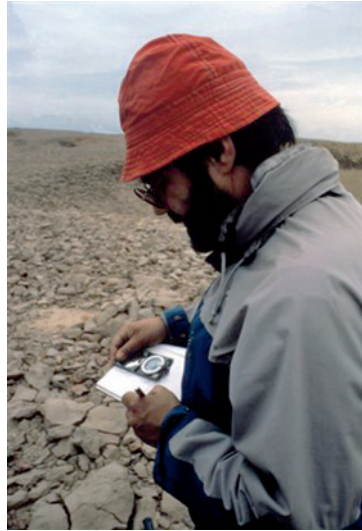
Quarries in Harappa. Fig. 13