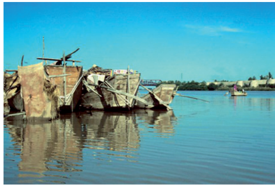
Quarries in Harappa. Fig. 3