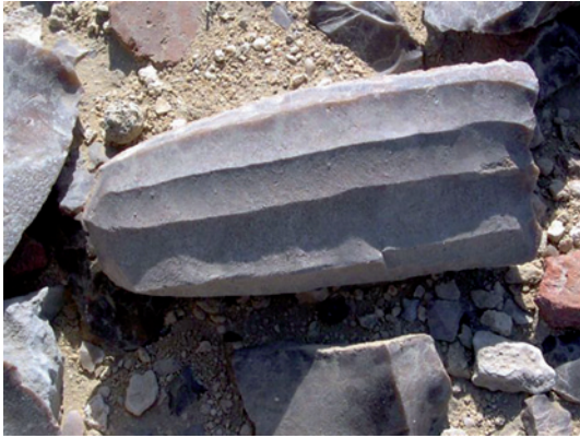
Quarries in Harappa. Fig. 29