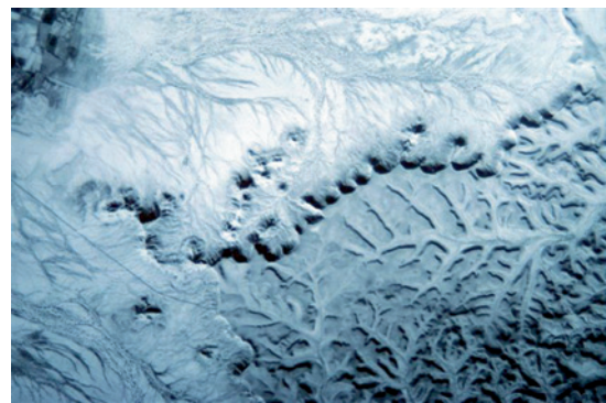
Quarries in Harappa. Fig. 12

blown from the Thar Desert dunes, and heaps of limestone block, deriving from the prehistoric mining activity (Fig. 14). All around these structures flint workshops were noticed (Fig. 15), represented by scatters of flint flakes and blades among which were typical Harappan-elongated blade cores and characteristic bullet cores with very narrow bladelet detachments