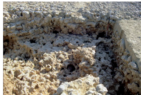
Quarries in Harappa. Fig. 22