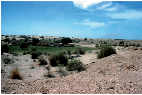
Quarries in Harappa. Fig. 7