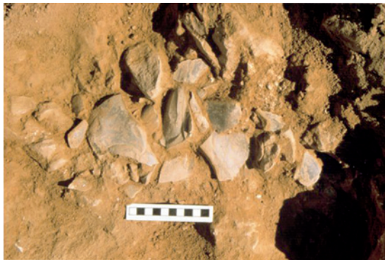
Quarries in Harappa. Fig. 25