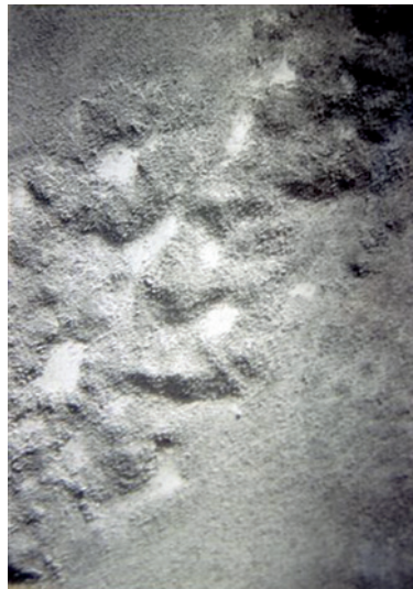
Quarries in Harappa. Fig. 14