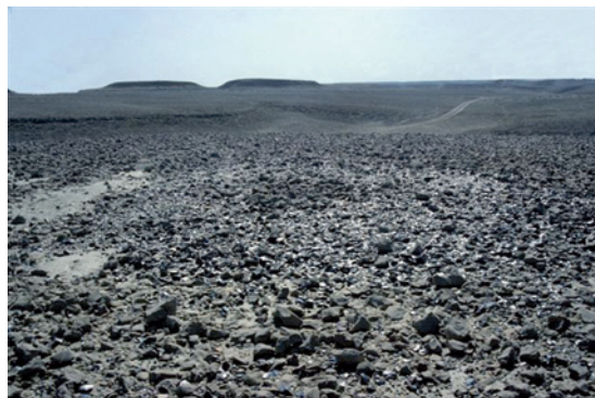
Quarries in Harappa. Fig. 15