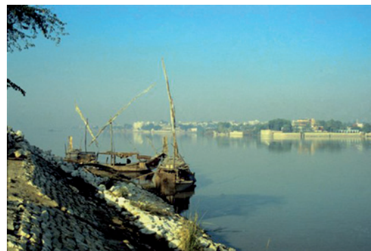
Quarries in Harappa. Fig. 2