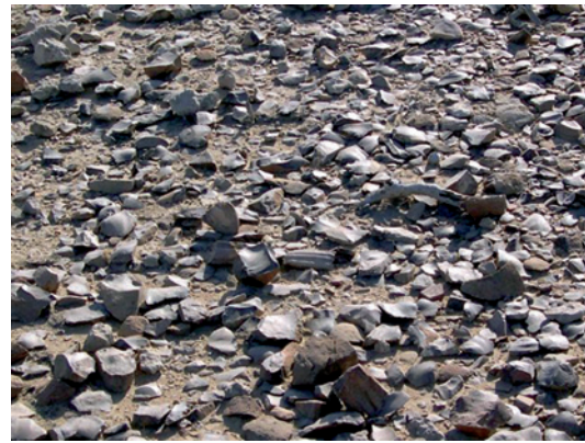
Quarries in Harappa. Fig. 26