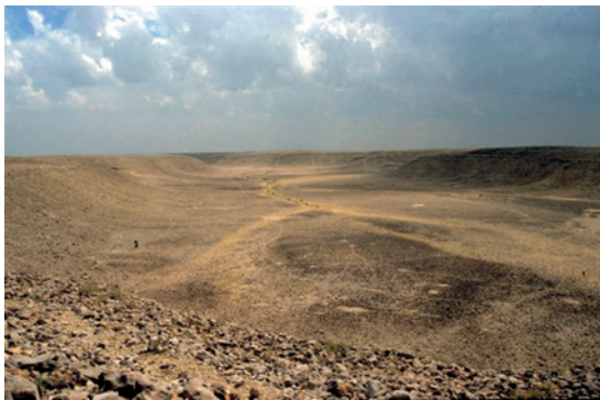
Quarries in Harappa. Fig. 20