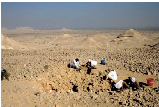
Quarries in Harappa. Fig. 21

3.5-km south of the shrine that bears the same name (Fig. 21). “The site is part of an impressive, wide ring-shaped group of features, some 120 m in diameter, related to a Harappan flint quarrying activity area” (Starnini and Biagi 2005: 1). The quarry was surrounded by several flint scatters and workshops (Negrino et al. 1996), one of which was connected with the production of narrow bladelets from typical bullet