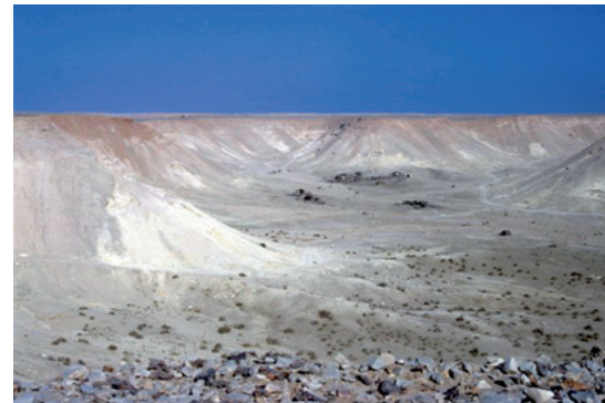
Quarries in Harappa. Fig. 18

wide and extended all over the central-western region of the hills. Harappan quarries were discovered also in the valleys of the internal mesas (Fig. 20).