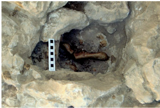
Quarries in Harappa. Fig. 24