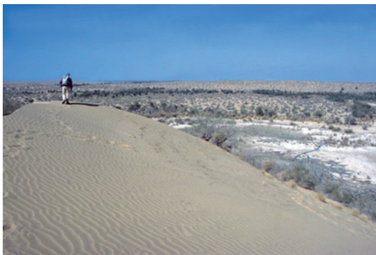
Quarries in Harappa. Fig. 9