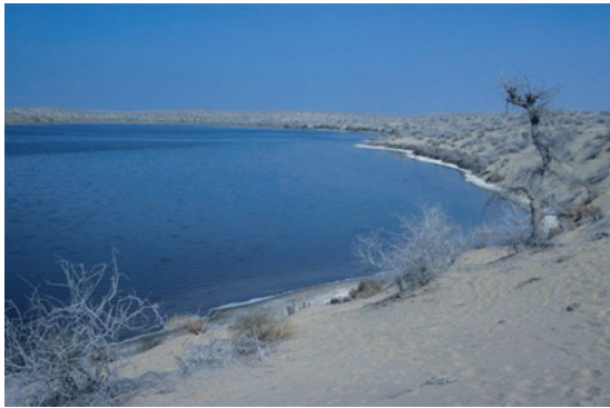
Quarries in Harappa. Fig. 8