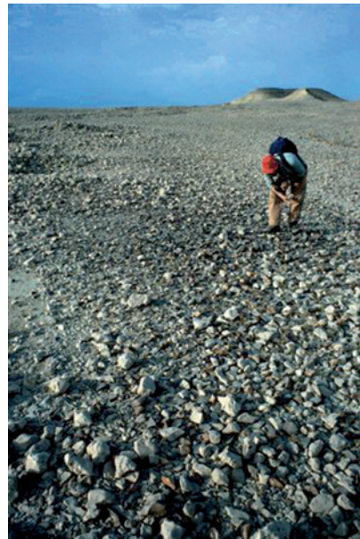
Quarries in Harappa. Fig. 5

The Rohri Hills, which are some 40 km long and 16 wide, extend in a north–south direction between the course of the Indus and the cities of Sukkur and Rohri, in the north, and the westernmost fringes of the Thar Desert, in the south (Fig. 7), which, in this part of the country is very rich in salt-lake basins (Figs. 8 and 9). The hills consist of fossiliferous limestone rocks of the Brahui attributed to the Middle Eocene/Early Oligocene period, very rich in seams of good quality flint, which attracted the prehistoric populations from