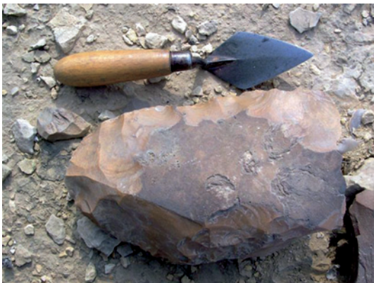
Quarries in Harappa. Fig. 30

centres of the Harappan Civilisation for being transformed into instruments for craft production around the middle of the III millennium BCE, but also complete, large blocks of flint already prepared for their transport.