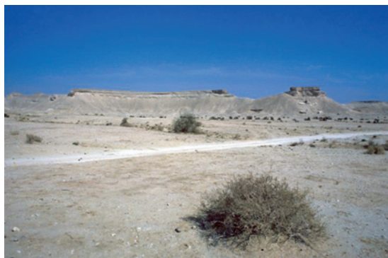
Quarries in Harappa. Fig. 4

them”, which were illustrated by the same author in another of her papers (Allchin 1979), where she describes each of them as “an area large enough for a man to sit cross-legged”, which “had been completely cleared of stones” (Allchin et al. 1978: 276).