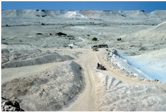
Quarries in Harappa. Fig. 19