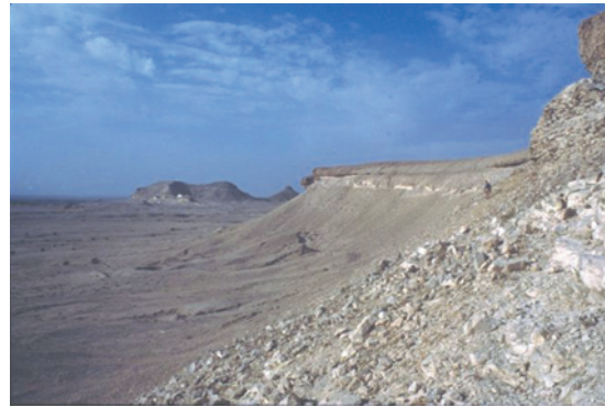
Quarries in Harappa. Fig. 11