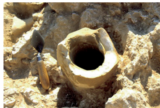
Quarries in Harappa. Fig. 23