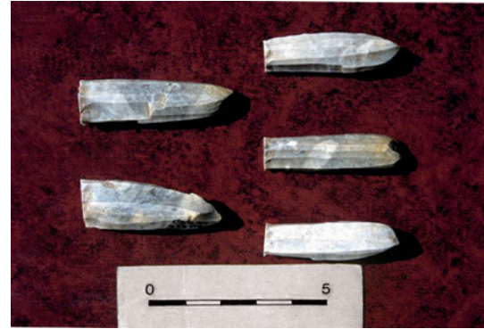
Quarries in Harappa. Fig. 16