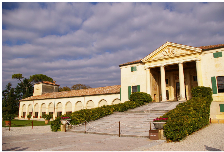
Fig. 4: Villa Emo a Fanzolo (territorio trevigiano) di Andrea Palladio (1558)

continues to weigh heavily given the exasperation of the numerous environmental conflicts which succeed one another along its course, from the increasingly more voracious quarries in the narrow valley bed amid the Grappa massif and the Asiago plateau, to those of the plains; from the pressure of buildings in the Bassano conurbation to production facilities “at risk” in the riverside areas along the middle course of the river; from too much water pumped for irrigation purposes to the pollution of the terminal section; from the expansion of the salt-wedge by tens of kilometres to the extensive building projects in the already suffocated historical urban areas of the Riviera del Brenta, without any doubt the most monumental stretch of river in the world.