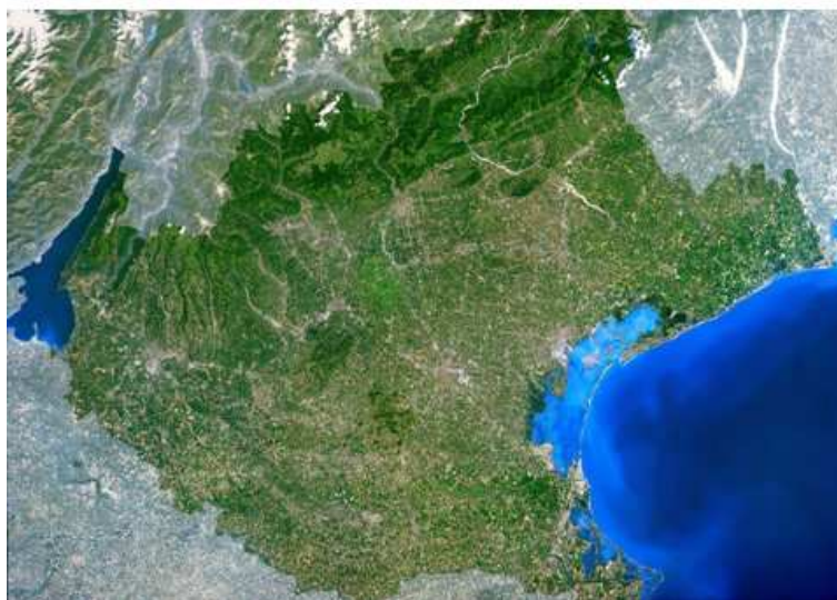
Fig. 2: Il Veneto dal satellite

But the phenomenon needs no confirmation considering what is indicated by the evolution of the statistical data provided by the ISTAT and by the CRESME or by a comparative comparison of satellite surveys. (Fig. 2) Urban anarchy and the consumption of land are a sad and worrying area concern which appears with vulgar arrogance to whosoever is obliged, in the context of local daily existence, to travel along the congested Veneto road system. This situation also suffers from a prolonged absence of the institutions which, precisely in Veneto, have managed to ensure many decades of continuity of consensus, exchanging this for short-lived controls on individual action, determining until only a short while ago, an irrational use of the land, detrimental to the most elementary components of daily living (suffice it to mention drinking water, traffic, air pollution, waste disposal).