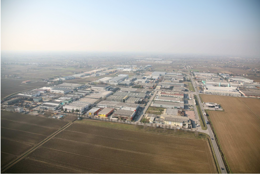
Fig. 3: Consumo di suolo agricolo nella bassa pianura

Every so often, people timidly raise their heads, like when a large fire broke out in an industrial shed of a globally-renowned Treviso company on 18 April 2007: people show concern and signs of protest, immediately refuted and classified as improper alarmism, subject to legal prosecution. The threats of administrators, more than the certainties of actual security, snuff out public opinion. Not to speak of the committees against the proliferation of mobile phone antennas, against incinerators, against the eastern ring-road, against the heavy traffic of lorries coming from the quarries on the plain, against the abnormal use of underground waters, a common asset transformed into merchandise. In other words, a crescendo of complaints spreading around, creating unhappiness and resignation in a portion of the public which in this part of the world continues to be reduced to a minority, except on rare, precarious and ephemeral occasions, as in the case of the administrations of Montebelluna, Padua, and the province of Rovigo. The scenario of an unhappy and anguished north east thus needs to recover hope. Hope in a different territorial culture, in a repentant class of local politicians which, on the one hand praises the traditional and memorial values of Veneto identity, and on the other does not hesitate to attack and cancel these forever in the name of not so much legitimate well-being, but of immoderate opulence and the exhilaration of individual success.