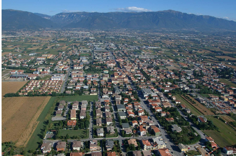
Fig. 1: Immagine dell' urban sprawl nell'alta pianura veneta