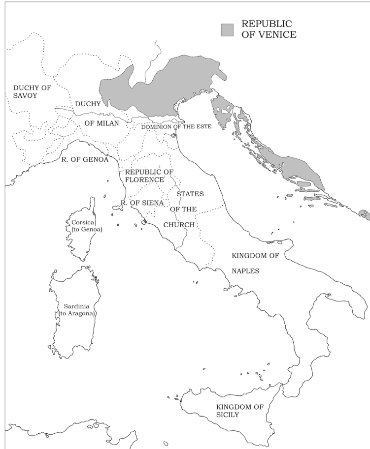
1) Italy in 1454