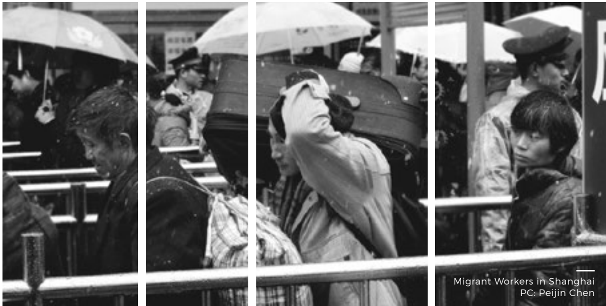
Migrant Workers in Shanghai