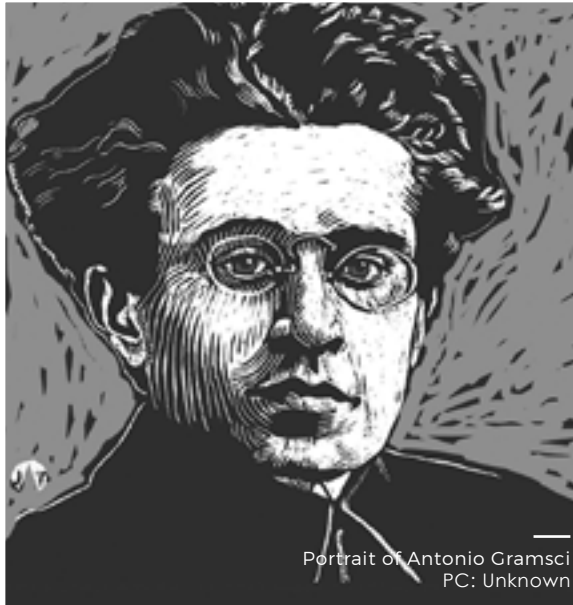
Portrait of Antonio Gramsci