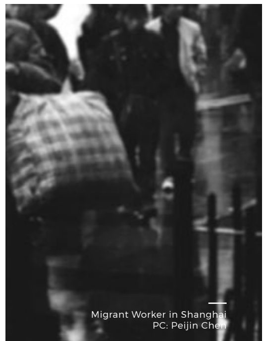
Migrant Worker in Shanghai