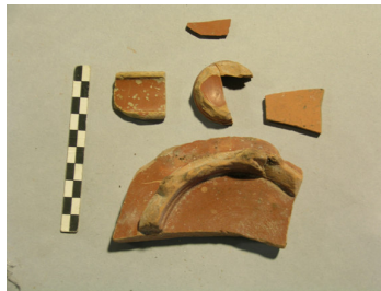
Figure 2. Shreds of Terra Sigillata from S. Ariano.