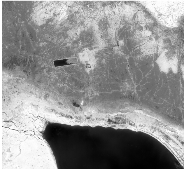
Figure 2. NDVI of ASTER data.

As preliminary results we have noticed that the NDVI (fig. 2) has proved to have better sensitivity than DVI to changes in vegetation cover and compensating for changing illumination conditions and other extraneous factors like areas where there is a shadow effect. This is particularly true in determined environmental circumstances, like in case of high vegetation cover, while the index showed its sensitivity to canopy background variations when applied in areas of low or sparse vegetation. Based on previous experience with these vegetation indexes, the aim in the prosecution of the research is to test a larger number of indices to identify those that can better fit specific situations not investigated before, like, for example, partially submerged vegetation.