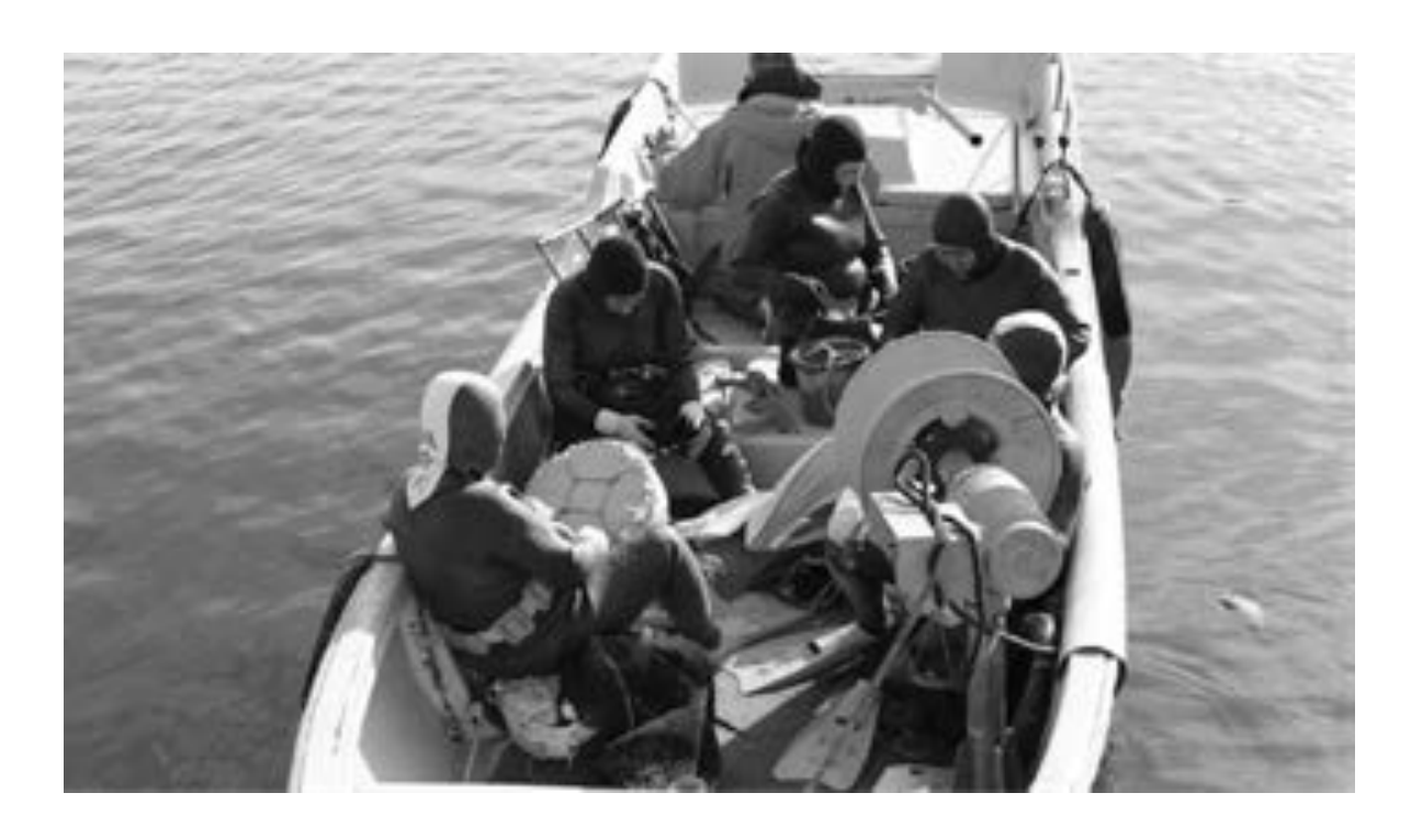
Figure 2. A group of ama (Kuzaki, 10th December 2014). A man, known as tomae , keeps watching over the diving women. When ama are almost out of breath and ready to ascend, they tug on the rope attached to their waist so that the tomae pulls them to the surface using a pulley system on the boat