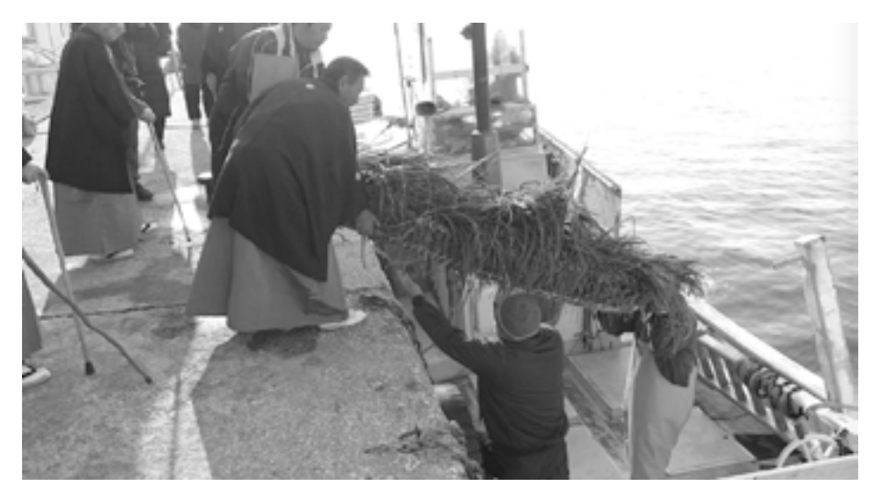
Figure 3. Yarimashobune while being transported in a fishing boat (Kamishima, 8th December 2014)

sink into the open sea (fig. 3.). Another important example of this category is the Katsuura Hachiman Festival performed at Katsuura Port (Nachikatsuura, Wakayama prefecture). Five kaitenma boats (sculling boats) start sailing clockwise at the port in the evening. Fishermen row the boats and, after several rounds, they stop rowing and jump into the sea for purification. Afterwards, a portable shrine ( mikoshi ) carried by a group of young fishermen approaches the port and, finally, is carried into the sea. Two ropes are tied to the mikoshi : one for the rowers of the kaitenma boats and another for a group that is waiting on the beach. Kaitenma boats rowers start rowing offshore, while the other group on the beach pull the rope to hold the mikoshi . After the ritual tug of war ends, the mikoshi is put on a boat and is brought to the shrine. This ritual event could be interpreted as a 'fight' to propitiate a big catch at sea or a rich harvest on the land.