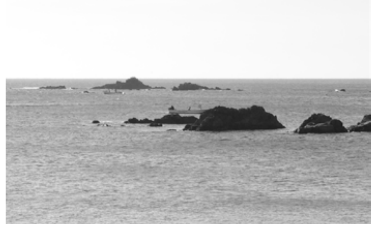
Figure 1. Ama operating in the coastal area (Kuzaki, 9th December 2014)

interactive process between local fishermen and their environment. This could be linked also to the reflections of McGann and Torrance: