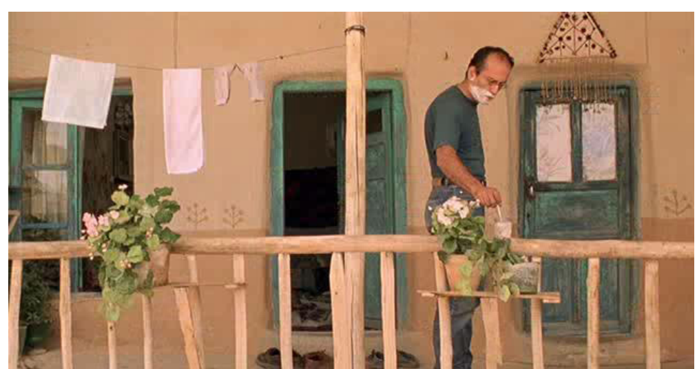
Figures 3-4. The Wind Will Carry Us

one is not pontificating, the other is complaining, asking for reassurance, advancing theories or doubts, or soliciting and goading the partner in a procession of arguments that revolve around the (true or feigned?) crisis in their relationship. In contrast, in the two close-ups described above, it is the silence (or rather the background sounds), and especially the (inward-looking?) looks of the characters, to take the lead role.