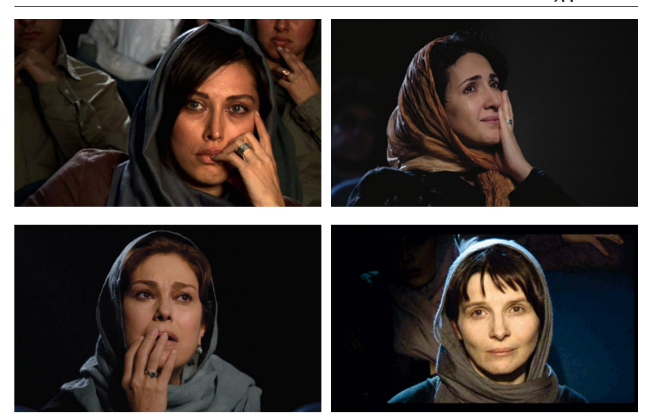
Figures 5-8. Shirin

given situation [...]. Her being the only professional actor of the film, this can also be interpreted as a self-reflexive statement about acting or, more specifically, method-acting that still holds very strongly in European and American cinema. She is evidently playing herself as an actress, when, just like a chameleon, she is deliberately changing her well known 'film faces' as well: the Hollywood star, the dramatic actress of European art movies and the almost unrecognizable, everyday face without makeup from Kiarostami's previous film, Shirin . (Kiraly 2012, p. 57)