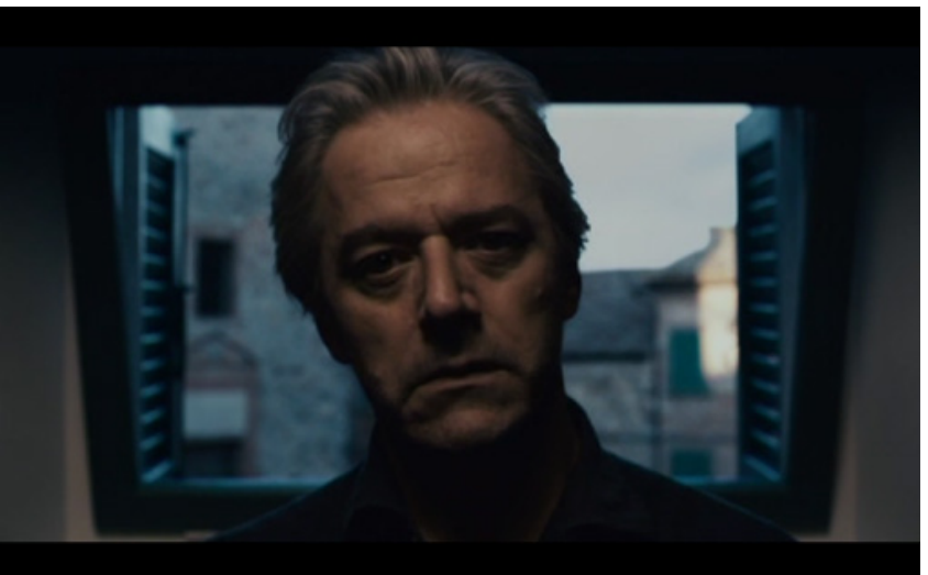
Figures 1-2. Certified Copy

hands, automated. He is absorbed in his thoughts with an absent stare. The tolling of the bells from a nearby church, a summons to the church-goers, seems to wake him. The man resumes his self-examination. He fixes his hair with a hand and leaves the bathroom. A slight zoom puts the window behind him in focus: the roofs of the houses and, in the distance, the church tower producing the ringing of the bells. The film credits start to roll (fig. 2).