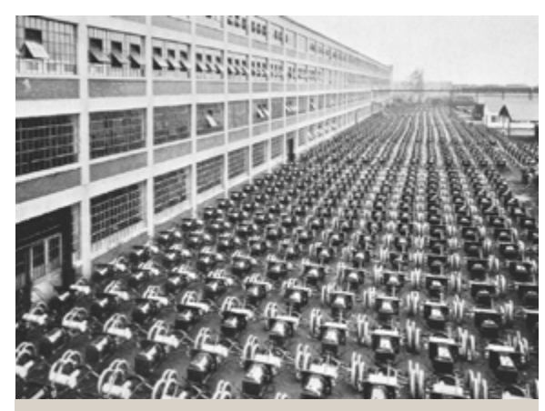
Highland Park Ford Plant, the first factory in history to assemble cars on a moving assembly line.

Our Future, intellectuals have turned to these interpretations in order to compensate for today's social and political impasse. Liberation from labour and the 'struggle to be human and educated during one's free time', emerge in Mason's analysis as the vision of a post-capitalist society that can grow inside the old one.