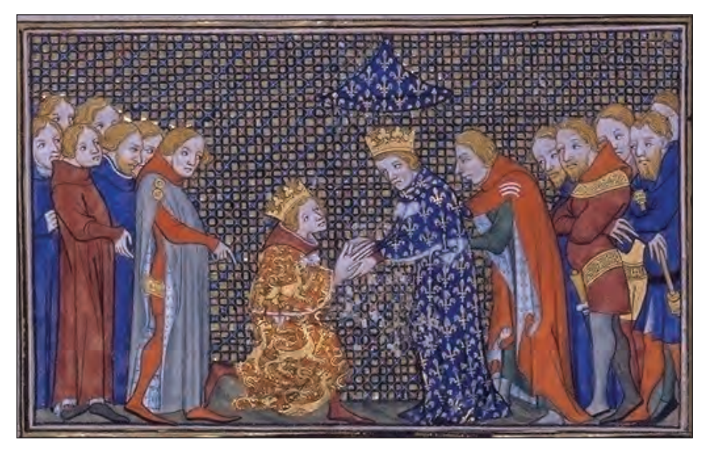
Figure 2: Homage: Immixtio manuum, flexibus genibus. Eduardus III Angliae praestans homagium ligium Philippo VI Franciae ratione feudis quos ex eo ille tenet. Hommage de Edouard III à Philippe VI en 1329

However, we can establish that in the Christian tradition penitential practices can be understood as adopting this style, and also, the most frequent ritual of humiliation: the apology and begging pardon to receive the forgiveness (see Koziol, 1992). In fact, this is also the most important mission of the ritual of humiliation in the customary system of the dispute resolution among the socially unequal social groups and, even more prominent, among those of equal social status.