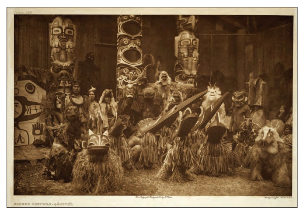
Figure 1: Edward S. Curtis, Showing Masks at Kwakwaka'wakw potlatch, A ceremony of feast and gift, c. 1914

societies, to be more precise. Mauss used some cases from different parts of the World to demonstrate the significance of the gift in cultural, economic, legal and political relationships among people within the society. He devoted special attention on the interpretation of the Native American Potlach, which today is regarded as the primary economic system (Gift economy).19 Therefore, it is not surprising that the homage itself, the gift, as a ritual phase of the ceremony, always assumes the first position.20 And precisely in the homage, even in the customary system of dispute resolution, we can find ritual gestures of humiliation, penance and a begging for forgiveness.