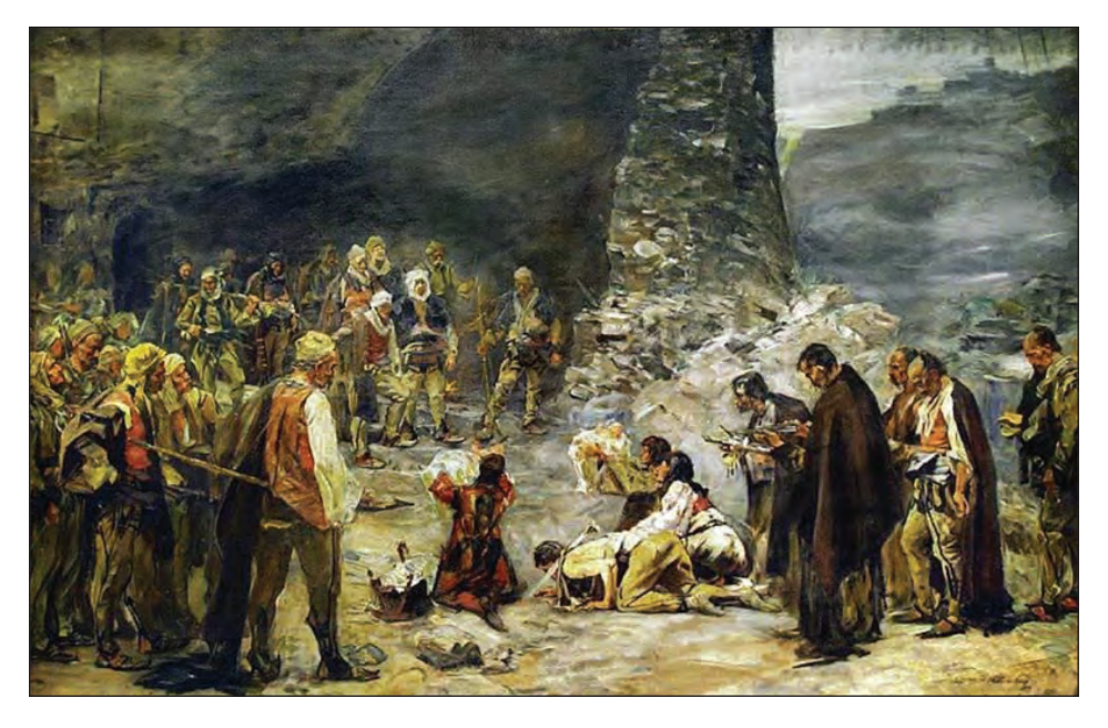
Figure 5: Paja Jovanović, Vendetta – Blood Feud. The ritual of the community mediation with children in their cradles to persuade the offended to compromise, that's the truce, compensation, reconciliation, forgiveness and peace perpetual (Paja Jovanović: Umir krvi, 1899.)

ation, as it is depicted in the painting of Jovanović, but they in fact actively intervene in the conflict resolution.