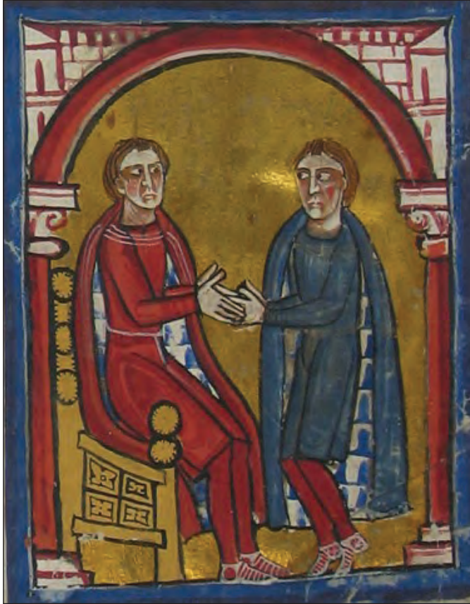
Fig. 12: Miniatura from the Liber feudorum Ceritaniae represents an homage (about 1200–1209) (Wikimedia Commons. File: Cerit7.jpg)

half of the 19 th century. 33 However, Bogišić's sources say that the jemci were chosen only in the most serious cases, while it happened frequently that a jemec or dorzon – and in some cases even more than one – was chosen for each side (Đuričić, 1979, 27). The Albanian legal historian Surja Pupovci picturesquely mentions the importance of the dorzoni in the resolution of conflicts, describing the concluding rite of the besa : the agreement was reached when the two representative of the parties conclude it by holding hands, but