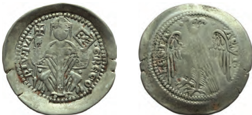
Fig. 2: Aquileia. Gregory of Montelongo (1251–1269). Coin with eagle. Monete e Medaglie di Zecche Italiane . Bernardi 22. AG. g. 0.99 R. BB. ( http://www.icollector.com/Aquileia-Gregorio-di-Montelongo-1251-1269-Denaro-con-aquila )

At that time, using the same strategies used for a military campaign, alliances that went beyond the offices they held were often made between individuals. This was especially true of many small feudatories, or vassals, who supplied troops necessary to their Seigneurs. But these alliances were clearly often overlapping. Self-interest led to