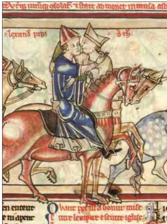
Fig. 17: Two churchmen giving the kiss of peace, 1240 ( http://www.jobev.com/medrom.html )

In this circumstance, the alliance took advantage of the fact that Venice was engaged in a war with Ancona. After the siege of Motovun, which tried to defend itself courageously, the count of Gorizia conquered Sveti Lovreč (San Lorenzo del Pasenatico).