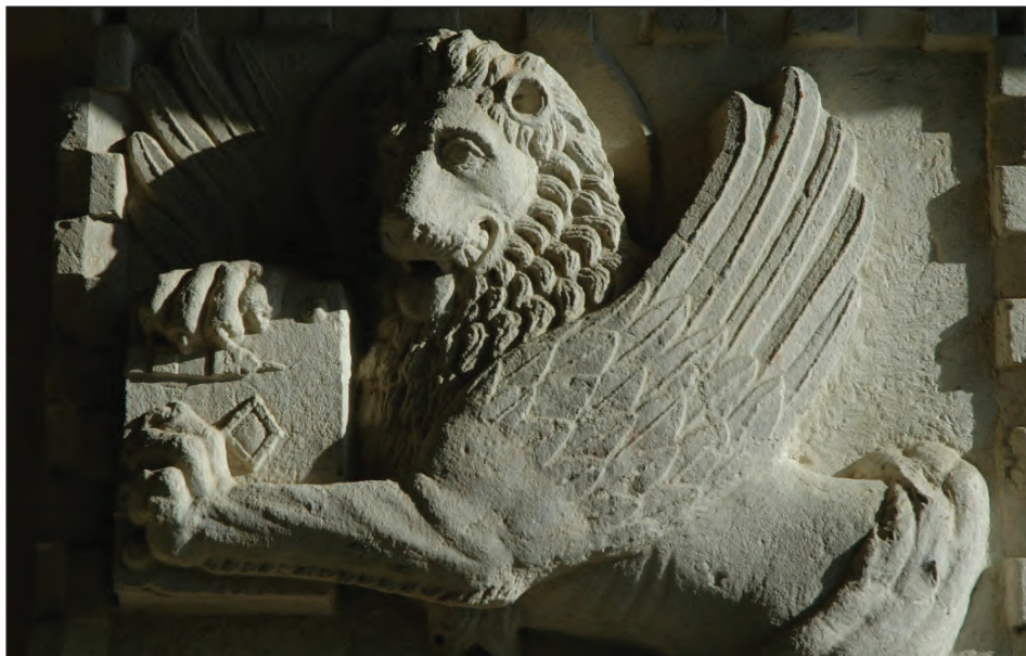
Fig. 18: The lion of Montovun, with the closed book (photo: D. Podgornik, 2007).

In his defense, Vicardus II blamed the destruction on Count Henry, who confirmed the accusation (CDI, II, 469, 838).