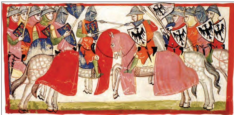
Fig. 1: The Battle of Benevento between Guelfs and Ghibellines, 1266, miniature in the Nuova Cronica of Giovanni Villani

Their favourable maritime position and the trade opportunities found in the towns of Istria had attracted a continual flow of money and consequently created economic and political independence. Thanks to various land grants in favour of the Istrian bishops, the cities with bishop's sees such as Trieste, Koper, Novigrad, Poreč, Pula and Pićan had spread inwards, taking possession of the peninsula hinterlands so important for food provision and defense.