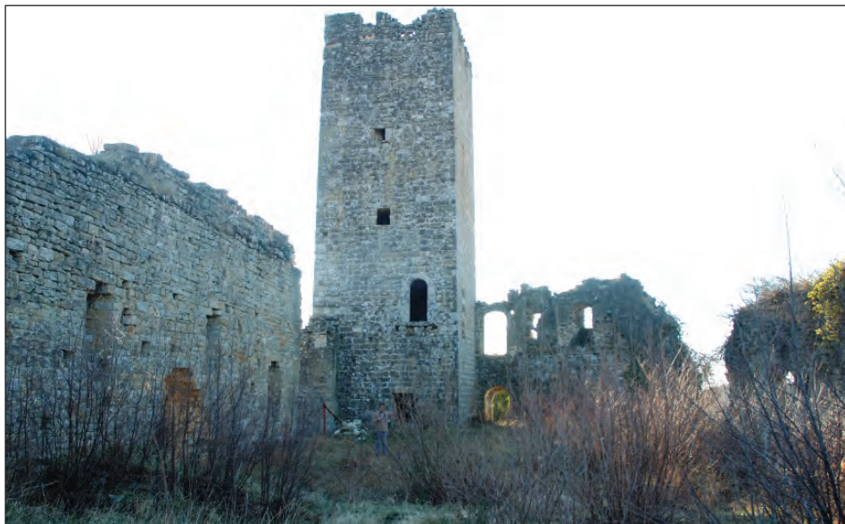
Fig. 9: The Castle of Momiano