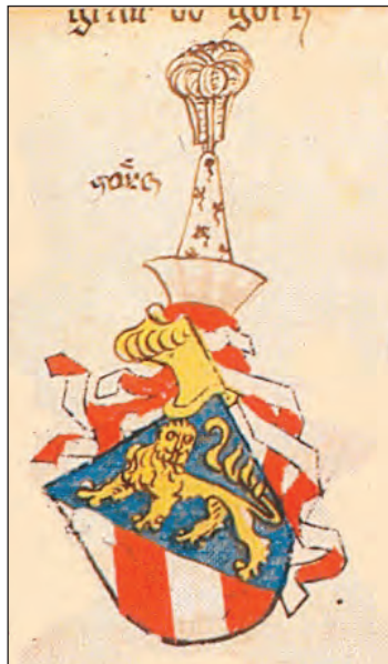
Fig. 3: Coat of arms of the County of Gorizia. Hans Ingeram. Codex d. ehem. Bibliothek Cotta , 1459 (Wikimedia Commons. File:XIingeram Codex 091b-Görz.jpg)

The Seigneurs of Momiano were in origin a branch of the Seigneurs of Duino, who were among the most powerful vassals of Aquileia. Voscalco, founder of the Seigneur of Momiano, was mentioned for the first time as Wosalcus de Mimilano in two documents of 1234, along with his two sons, Cono and Biaquino. They were important vassals and ministeriales of Aquileia, in origin faithful to the politics of that town, which produced important benefits for them. Indeed, the two brothers held the office of Podestà in several Istrian towns: Cono in Piran (1259, 1272) and in Buie (1272); and Biaquino in Novigrad (between the years 1259 and 1261), Poreč, (1261) and Motovun (1263). However, in those very years the two brothers of the Momiano house were already in contact with the Count of Gorizia. This is demonstrated not only by the mention of their names in a series of acts in which the Count of Gorizia is also named, but also by family ties that had linked the Seigneurs of Momiano for fully two generations with the Seigneurs of Rifembergo, in the hinterland of Gorizia, one of the most important ministeriales families of the Counts of Gorizi. In fact, in 1249, Biaquino da Momiano took as wife Geltrude, daughter of Ulrico I of Rifembergo (Štih, 2013, 171–172).