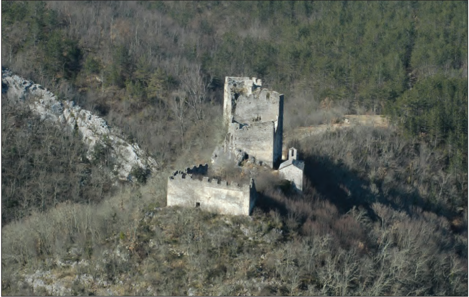
Fig. 7: The Castle of Pietrapelosa

lands put themselves under the care and protection of Venice. Under the pressure of the troops of Koper and Gorizia, that first to do so was Poreč, on the 27 th July, 1267. Although the alliance between Koper and the Count of Gorizia weakened liberties and autonomies, other Istrian towns followed the example of Poreč. Among these were Umag (1269), Novigrad (1270), Sveti Lovreč (1271) and later also Motovun (1275). Even though by these agreements the towns did not “transfer” sovereignty, which still remained in the hands of the Patriarchs of Aquileia, but “[...] entrusted themselves to the Venetians in protection and defense”, they succeeded in preserving their municipal autonomy, balanced by the powers exercised by the Podestà chosen from the Venetian aristocracy (De Vergottini, 1925, 22).