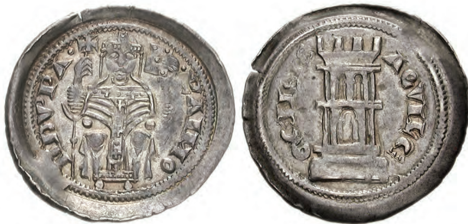
Fig. 15: Coin of the Patriarch Raimondo della Torre with episcopal vestments, seated on the front with the gospels in his hand. Tower of the family coat of arms

could guarantee a lasting peace: the marriage between representatives of the opposing parties, or at least, as became prevalent later, the exchange of godparents. 39