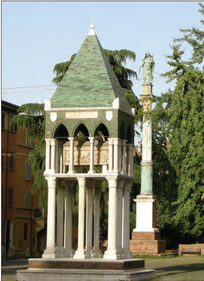
Fig. 20: The Ark of Rolandinus Rodulphi de Passageriis in Piazza San Domenico, Bologna

However, it is the documents concerning the feud between the Patriarch of Aquileia and the Counts of Gorizia that are evidence of how written laws show that the ritual forms and gestures of the customary system of conflict resolution were not only maintained but were regularly inserted into the ritual formulas of written law. Above all they document