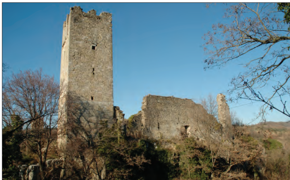
Fig. 4: The Castle of Momiano

The historical sources mention Vicardus of Pietrapelosa, Seigneur of Grožnjan, in the context of Koper's rebellion against the Patriach, which occurred on the 13 th January, 1238 – more precisely, in an agreement sign at Cividale (Kos, 1928, 715) on the 3 rd July 1239 between the Patriarch of Aquileia and Meinhard, Count of Gorizia (Kos, 1928, 685), in which the latter is granted the freedom to elect the Podestà in Istria or in Friuli, but not elsewhere,