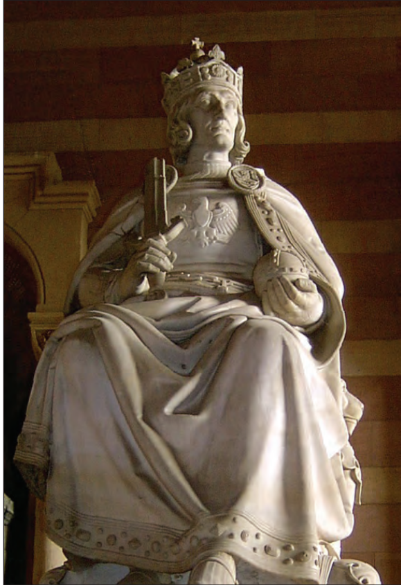
Fig. 16: Rudolf_of_Habsburg_Speyer.jpg (Wikimedia Commons)

of the damages and the list of participants in the battles that had taken place in July and August of 1267. This supplement tells of a vendetta of the Seigneurs of Momiano against those of Pietrapelosa following the murder ( turpiter interfectus ) of Biaquino of Momiano. And not only: the gruesome vendetta of Cono of Momiano had led him to undertake other military expeditions in the lands of Gorizia in the same years, seeing that, besides assaults on the Tower of Buzet and the Castle of Pietrapelosa, the document also reports attacks on other castles of the Patriarch. 42 Among the protagonists mentioned in the document we find not only Cono da Momiano but also Friderico de Mimiliano, Woscalco filio dicti Domini Chononis de Mimiliano, as well as Frater Galvanus et Fridericus de Mimiliano.