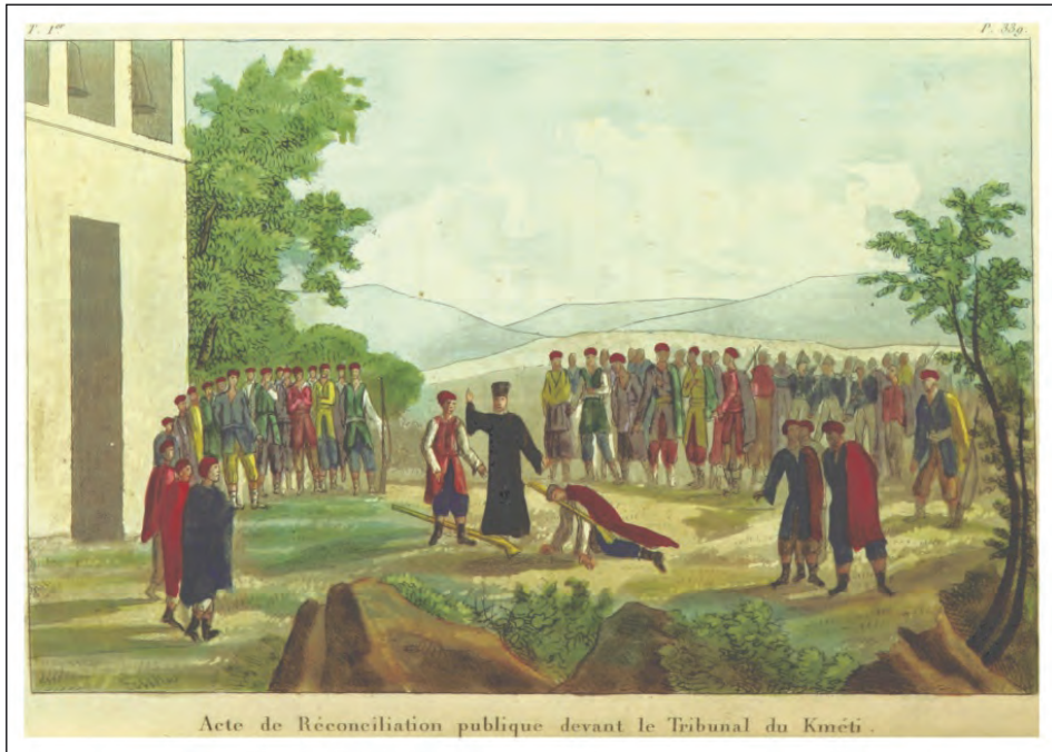
Fig. 14: Act of public reconciliation in Montenegro. Voyage historique et politique au Montenegro (1820) by Violla De Sommières

After the exchange of the acts of compromise and the declaration of truce, which in all likelihood led to the release of Patriarch Gregorio, the agreement was also confirmed (AF, 197). Unfortunately, the documents available do not allow us to know if the chosen arbiters managed to make an inventory of and assess the damages suffered by the two opposing parties by All Saints' Day (1 st November 1267) or Easter (8 th April 1268). We have no notice of possible conflicts during the truce, but just one month after its expiration (All Saints' Day, 28 th May 1268), the reasons for the dispute had undoubtedly worsened, since on 3 rd July 1268, under the hill of Medea to the west of Gorizia, the troops of Gorizia killed in an ambush the Patriarch's vice-dominium, Bishop Albert of Concordia. 37