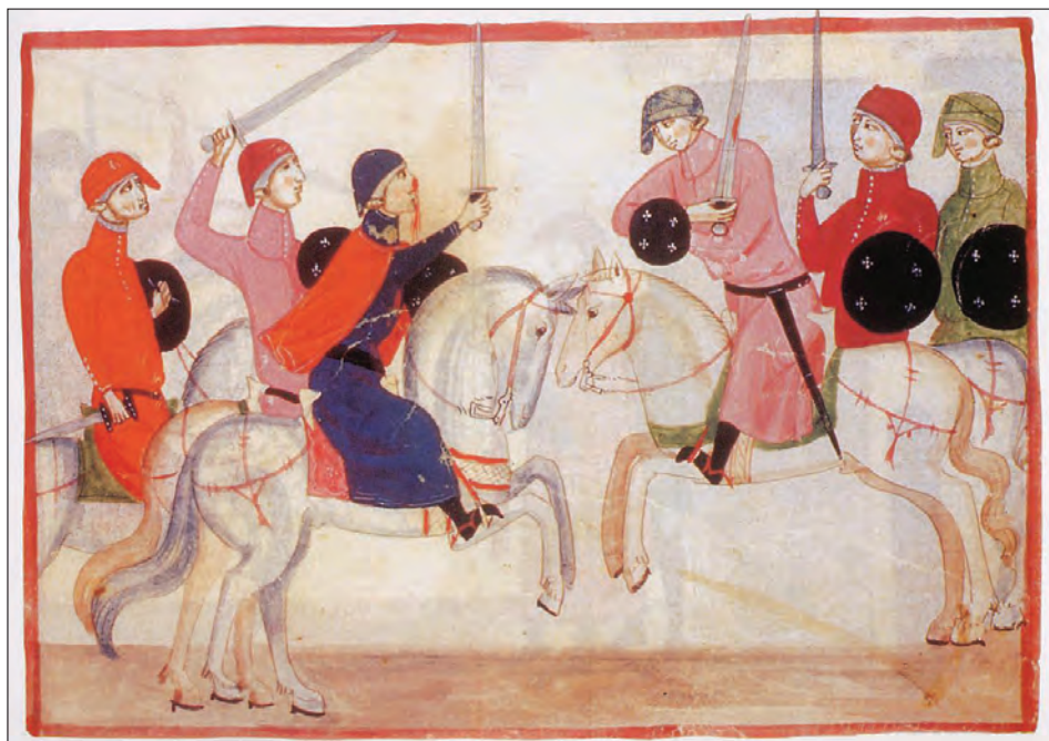
Fig. 11: Vendetta in Florence, 1300

since they were holding the Patriarch in captivity. We need only think of the many descriptions of medieval prisons, for example the story of the English King Richard the Lion-Hearted, to understand that at that time situations like these were commonplace (Kos, 1994, 109–115). In the case under examination, the proof can be clearly inferred in the quotation of the above-mentioned truce of 1274, when in 1267 the counts of Gorizia imprisoned the Patriarch, “just as always happens in wars” ( que solent fieri in guerris ). 20