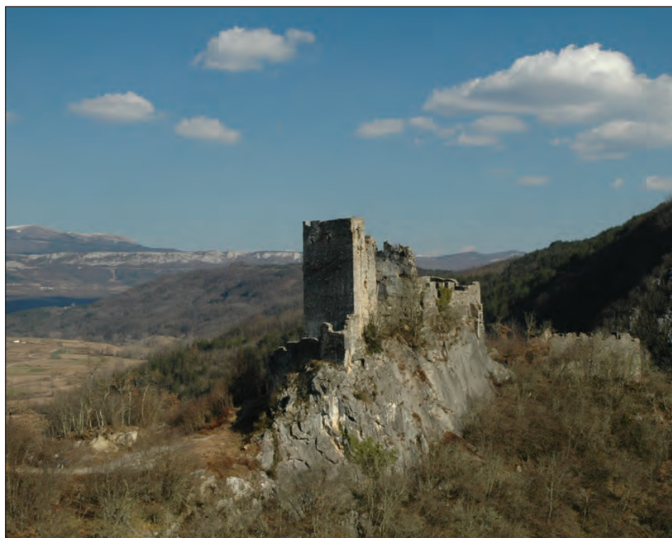
Fig. 5: The Castle of Pietrapelosa