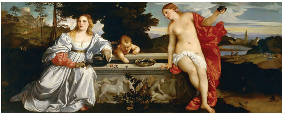
Fig. 19: Amor Sacro e Amor Profano by Titian as apology of Divine and Profane Law (Wikimedia Commons. File:Tiziano – Amor Sacro y Amor Profano (Galería Borghese, Rome, 1514).jpg)

As we have seen, the last decades of the 13 th century in Istria are marked by continual struggles for territorial conquests and wars that produced victims and devastation. The disastrous effects of these struggles were aggravated by the frequency with which epidemics were spread, also in neighbouring areas (so much so that bordering populations struck by the epidemic sometimes found refuge in Istria). This is what happened, for instance,