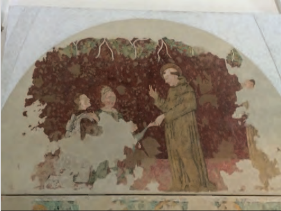
Fig. 6: Abbey of Rosazzo – detached fresco in the church