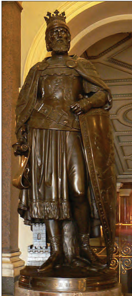
Fig. 10: Ottokar II. Přemysl

These documents testify to the extensive diplomatic activity between the two conflicting parties, which was carried on by mediators of the king in the name of the community, as well as to the modalities of conflict resolution, in particular to the drawing up of the acts of reconciliation, which guaranteed the preservation of individual and community honour in the social order. These compromises and reconciliations, though (or, as in the case dealt with here, just for this reason) imposed by the central power, out of tradition and ritual rules and, as we have seen, in agreement with the written law then establishing