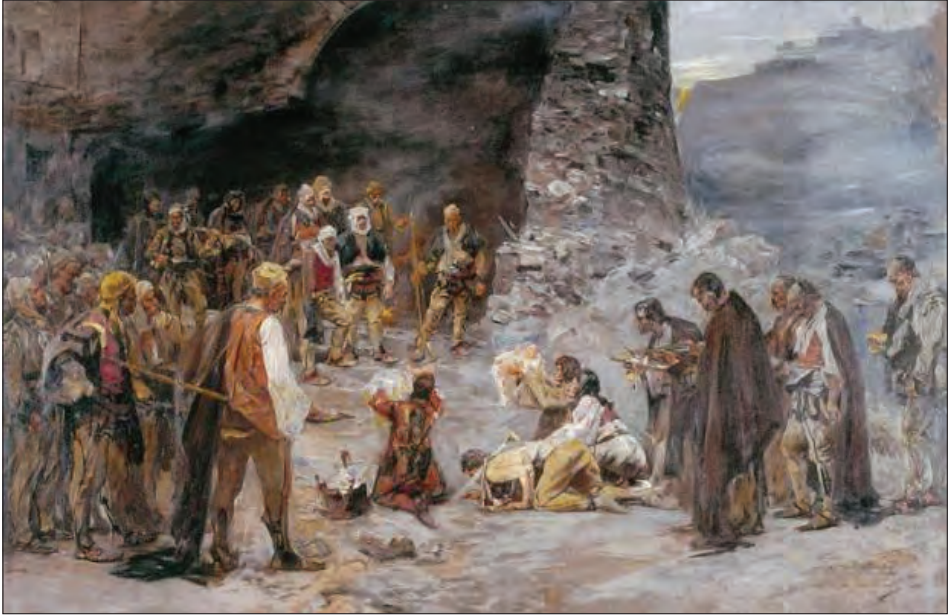
Fig. 13: Paja Jovanović, Umir krvi (truce) , 1889. The ritual of the community mediation with children in their cradles to persuade the offended to compromise, that's the truce, compensation, reconciliation, forgiveness and peace perpetual. Galerija matice srpske u Novom Sadu ( https://buk181.wordpress.com/2011/05/22/the-muzej-2-paja-jovanovic/krvna-osveta/ )

Just the sole gesture of taking away and then giving back the gun shows a clear tendency to hear the ritual appeal of reciprocity and community mediation. With the help of these rites the community creates a balance, exercises social control, and permits the reintegration and lasting reconciliation of the conflicting parties (Verdier, 1980, 24–30). Naturally, this is an ideal social formula, but it was evidently effective in the system of conflict resolution, as J. M. Wallace-Hadrill illustrates at the end of his legendary study, The Bloodfeud of the Franks :