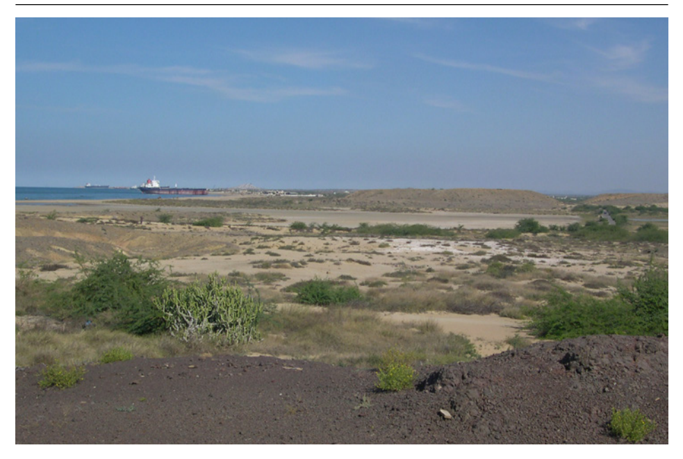
Figure 1. The Bay of Daun with a shell midden in the centre of the image marked by a white spot (photograph by Paolo Biagi, January 2008)

the results could be compared with those obtained from other sites discovered along the coast of the Arabian Sea and the Persian (Arabian) Gulf (Cleuziou 2004; Biagi, Nisbet 2006; Biagi 2008a; Boivin, Fuller 2009; Biagi, Nisbet, Fantuzzi 2017, 2018).