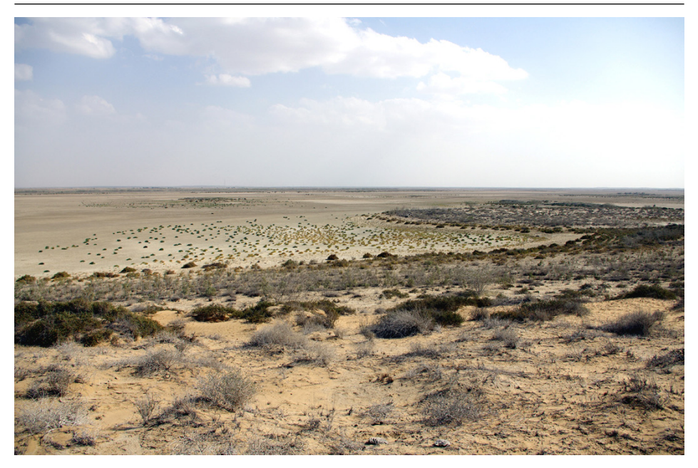
Figure 2. The dry depression of Lake Siranda from the south eastern shore from site SRN-63

sion stretches from north to south. It is bordered by the Holocene dunes of the Sonmiani Hills in the west, and the Pleistocene sand plain that extends to the east (Snead, Frishman 1968). It is delimited, in the south, by the Khurkera plain, which is formed by the silting of the Winder River flowing from the Pab Range (Pithawalla 1952, 33). Lake Siranda, ca. 14 km long and 3 km wide, only 0.30-0.45 m above the present sea level, is located in the southernmost part of Las Bela province (Snead 1969). It is seasonally fed by monsoon rains draining into the basin mainly by the Watto River, an easternmost branch of the Porali (Stein 1943, 198). Research in the area was resumed by the Italian Archaeological Mission between 2011 and 2014. Its scope was to verify the presence of prehistoric shell middens along its ancient shores, to establish a radiocarbon chronology of the sites, and interpret the reasons why the lagoon started to dry around the end of the of the third millennium BC, when the Indus Civilisation finally collapsed. The surveys led to the discovery of 76 archaeological sites, mainly Neolithic and Bronze Age shell middens, 33 of which were AMS radiocarbon-dated by one single,