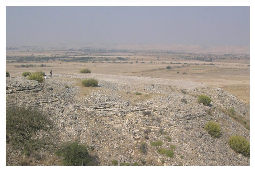
Figure 4. Daphro Hill: parallel Indus Civilisation chert mining trenches at the north-westernmost edge of the hill (photograph by P. Biagi, January 2008)

ology of Shah Abdul Latif University in Khairpur. The research was conducted between 1993 and 2002. It led to the discovery of hundreds of archaeological sites located on the hilltops (Biagi, Shaikh 1994). Its main scope was to record the impressive number of Indus chert mines discovered in the central-western part of the Hills since 1986, and to excavate a few lithic sites by trial trenches and, whenever possible, date them (fig. 3). Following this experience, the research was resumed at Ongar in cooperation with the University of Sindh, Jamshoro. The new project led to the discovery, recording and mapping of dozens of unknown Bronze Age Indus Civilisation chert mines on the hills of Ongar, Daphro (fig. 4) and Bekhain, south of Kotri in Hyderabad province (Biagi 2007b). The exploitation of the chert resources in the area is marked by the recurrence of mining trenches that border the edges of the limestone mesas, as well as heaps of debitage flakes, on the top of which typical Indus Civilisation subconical blade cores were collected (Biagi, Cremaschi 1991; Biagi, Franco 2008; Biagi, Starnini 2008, 2018b; Starnini, Biagi 2006). Other new chert mining complexes were later found close to