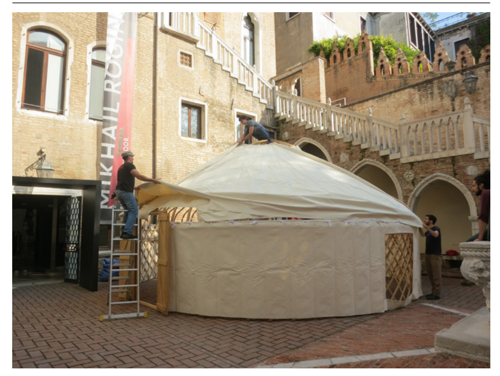
Figure 2. Veneto Night 2014: the yurt is almost ready