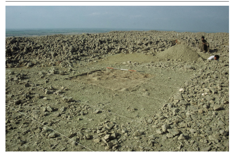
Figure 3. Rohri Hills: excavations underway at the Indus Civilisation chert workshop and mine RH-59

adult specimen of mangrove gastropod either Terebralia palustris or Telescopium telescopium (Biagi, Nisbet, Fantuzzi 2017, 2018).