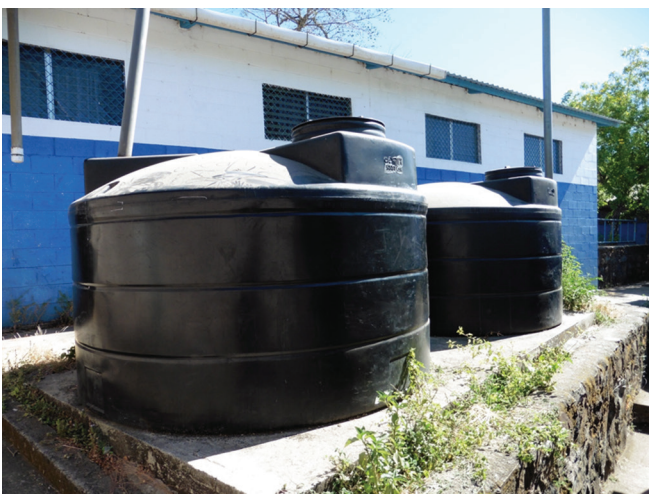
Figure 1. A detail of the local school.

El Salvador is the tiniest and most densely populated country in Central America and presents and active volcanic activity, with high seismic and hydrogeological hazards. Salvadoran human development index is 0.674<sup>[30]</sup>, slightly worsening in recent years. Our case study is located in one of the most deprived and densely populated departments of the country, i.e., Cabañas, bordering Honduras [ Figure 1 ]. Specifically, the rural area of Santa Marta is addressed, near the town of Victoria. Here, local communities and their related physical, socioeconomic, and cultural dimensions are closely intertwined with Salvadoran recent history, namely,