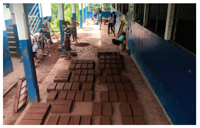
Figure 4. The controlled natural drying of a stock of adobe bricks.

Thermal mitigation for Salvadoran warm climate is quite promising; this is particularly interesting if we consider the affordability of the adobe brick together with its easy design and manufacturing. At the same time, water protection is crucial in rainy contexts like this. The absence of special innovations and strong mechanical performances for buildings higher than one or two stories is acceptable for the local Salvadoran culture, especially in rural areas like Santa Marta. However, some limits are suggested for higher buildings in similar rainy contexts. In general, the need for more demanding energy and mechanical performances requires a case-by-case analysis for