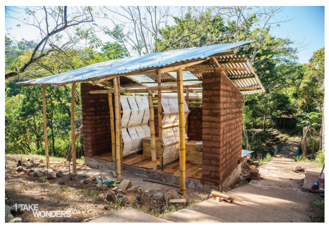
Figure 5. Advance of the building site at the end of the 12<sup>th</sup> week.

other contexts, strongly depending on local climate and dwelling cultures. Material and technological innovation are also possible and sometimes successful between local vernacular wisdom (such as adobe bricks) and more recent knowledge from other regions; this is for instance the case of a recent study on some Sudanese vernacular innovative building technologies<sup>[26]</sup>. One last remark might involve the cultural dimension; here, the recovery and improvement of vernacular technologies were encouraged by parts of the population, yet still causing skepticism in some other parts. Skepticism is generally due to the dominant social imaginary, leading to desire exogenous, often Global Northern values and goods, and to reject own ones, sometimes considered as "backward" also in the light of uneven South-North power and economic conditions<sup>[3,29]</sup>. This of course includes dwelling and its features. In spite of an increasing interest from highly industrialized contexts, as a matter of fact, a major