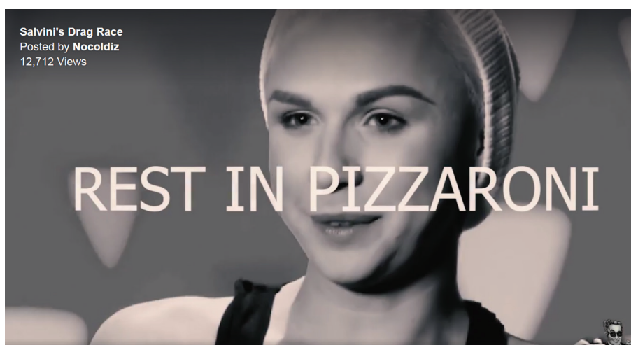
Video 11. Salvini's Drag Race ironic video.