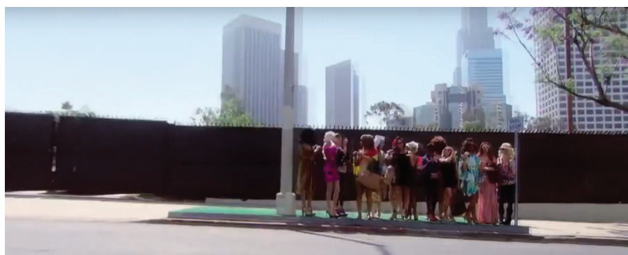
Video 3. Italian promo on Fox Life (2012).