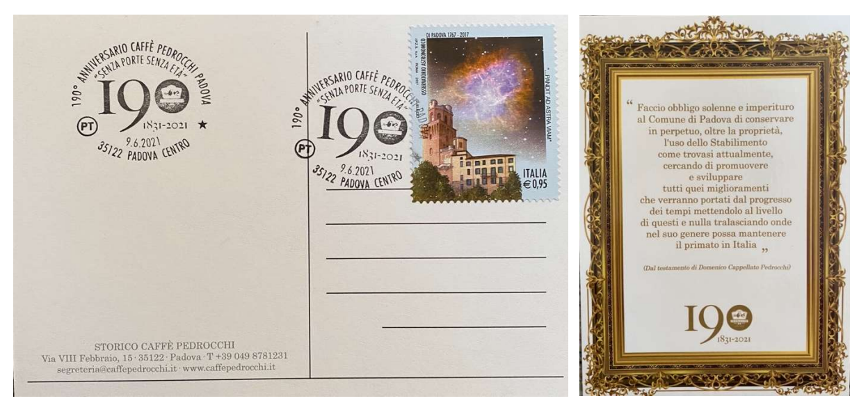
Figure 6 - Postal Card offered in the occasion of 190th Anniversary (from the authors)

The concession to the new management, F&deGroup, represented a further moment of discontinuity with the previous phase. As a matter of fact, probably, after the recent restorations, the Superintendence stabilized its conservationist role as well as the Municipality did with the imposition of the strict rent contract. Given this situation, and by acting as "practical historians" and managers, F&deGroup managed to impose a new form of the past: a past seen not only positively, but also proactively. In particular, re-interpreting some past elements into today's codes and context, the current management adopted a vision of compromise, between the respect towards a past to be enhanced and