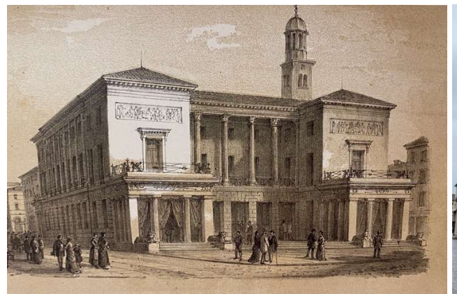
Figure 1 - Caffè Pedrocchi at its origins (from Pedrocchi, D.C., 1881) and today (author's picture)

This is where our empirical story starts: how did the café enact this explicit call for a temporal tension between past and future over time? How, on its basis, did it use the past? Specifically: which past(s) were enacted and conducive to which future outcome(s)? Which actors had an agency in this process? By following these empirical guiding questions, we wish to address the broader theoretical issue of how the past becomes past in organizations, and how it informs future outcomes .