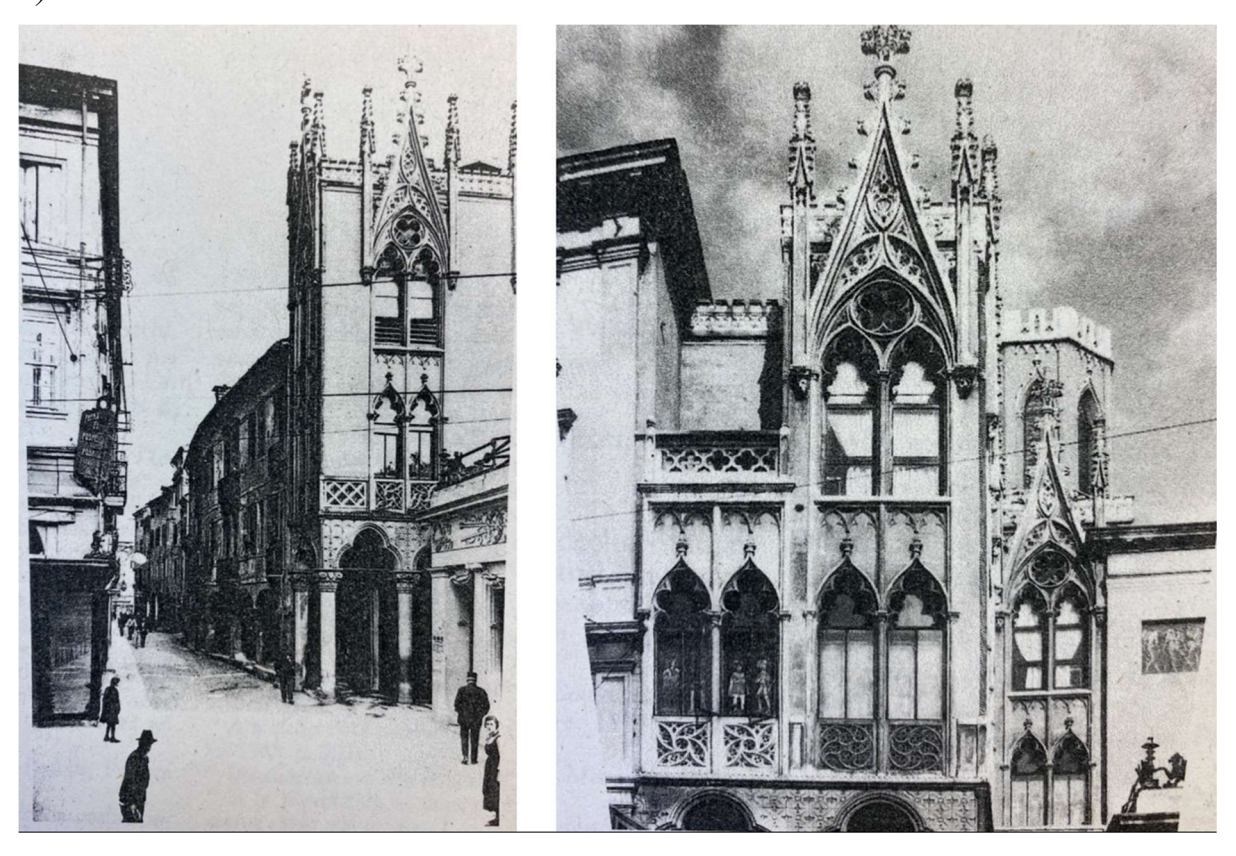
Figure 3 - Pedrocchi's stained walls during Fascism (from Baù, 2013)