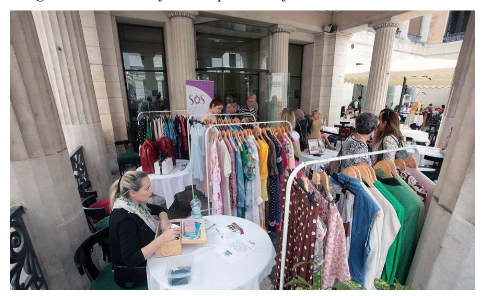
Figure 5 - A Vintage Market in the café arises polemics (from Il Mattino di Padova, 1st June 2015)

The new compromise between the owner and the managers of the café-monument seems to be put into practice in a new project for the imminent future of the Café. In coherence with a tourist and cultural development plan for Padua city, the Municipality is aiming at re-qualifying the factory's second floor apartments by means of the construction of a luxury Boutique Hotel with design furnishings. The project is outlined in collaboration with F&deGroup, which will invest in the spaces' renovations and will be the future manager of the hotel.