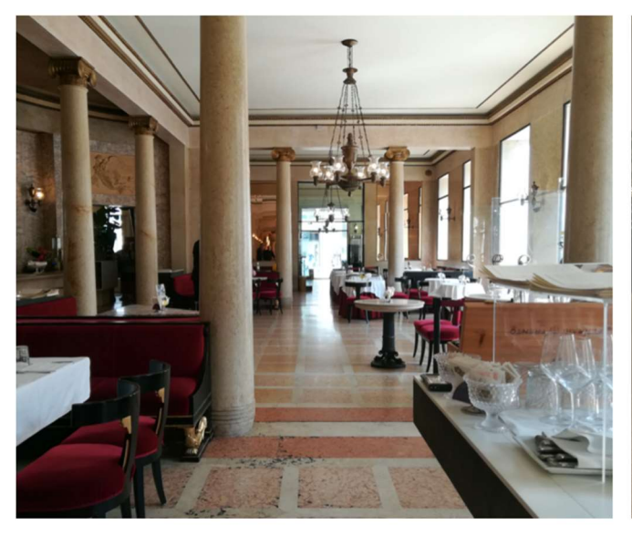
Figure 4 - Historical Rooms and 'Modern Bar' today

In 2017, due to continuing contestations with Superintendence about the use of the rooms and the terrace, F&deGroup threatened the Municipality to abandon the management of the Café. However, the Municipality acted as a mediator and extended the terms of the concession by enlarging the use of the terrace and by imposing training courses by the Superintendence for the employees (Malfitano, Il Mattino di Padova, 24<sup>th</sup> November 2017).