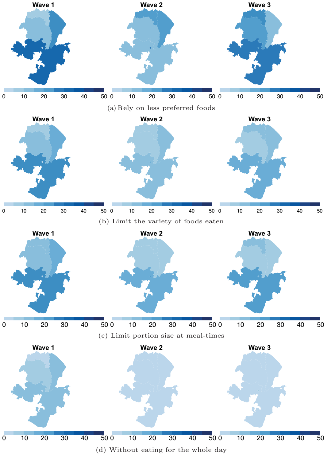
Figure 2. (Colour online) Food security situation in Ethiopia (2011–2012; 2013–2014; and 2015–2016)