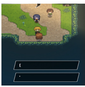
Figure 15 Text conversion errors. From left to right, top to bottom: a) selection text, b) dialogue text, c) missing enemy name