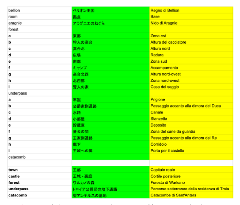
Figure 3 Google Sheet, text organisation. The arrangement of the text corresponds to the organisation of the data in the original files. The yellow area is for text translation, and the green area is for the original text that should remain unchanged. White areas are used as keys to match the translation in the original code and must stay unchanged.

Note that two green columns (for name and title keys) must correspond to two yellow columns for translations. The white column corresponds to the sub key that must remain in English. The following figure represents the format for the [area] and [areaSub] tabs. Students are prohibited from translating or inserting text in the non-yellow areas.