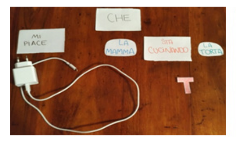
Figure 1 illustrates the derivation of an object relative. Before movement, the agent is in its canonical position before the verb, and the theme occurs after the verb.

Movement was taught using coloured cards on which the different elements of the sentence were reported (Figure 1). Cards were used to show participants that movement-derived sentences are created by the movement of elements from one position to another in the sentence.