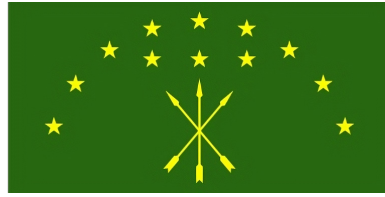
Figures 1-2 The contemporary Circassian flag in Jordan (left) and the detail of the twelve tribes (above)