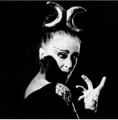
Martha Graham.